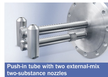
Push-in tube with two external-mix two-substance nozzles

Replacing the air cap with the interior mixing air cap reduces the drop speed to 45 %. The exchange surface between the exhaust gas and liquid increases by a factor of 2 to 2.5. With the internal-mix two-substance nozzle, the liquid also escapes from a centric hole, however, this time into a mixing chamber. A cone in the mixing chamber causes the liquid jet, which meets the cone tip centrally, to be distributed to a film which is broken down into drops by the swirled atomised air. The flanks of this cone contour end in the nozzle holes of the air cap. The holes are inclined according to the cone gradient, meaning that the remaining liquid is blown out in a defined manner and the loaded surface is larger. The performance range of the two-substance lances ranges from 10 to 1500 l/h per single nozzle.