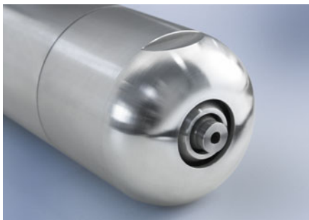
Front area of a SCHLICK three-substance lance

It is also possible to additionally charge a channel with air, gas or steam and thereby create a larger exchange surface between atomisation medium and liquid.