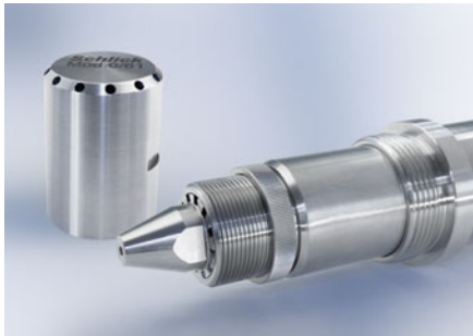
SCHLICK two-substance nozzle with internal mixing Patented SCHLICK interior mixing cap

Replacing the air cap with the patented interior mixing air cap reduces the drop speed to 45%. With the internal-mix two-substance nozzle, the liquid also escapes from a centric hole, however, this time into a mixing chamber. A cone in the mixing chamber causes the liquid jet, which meets the cone tip centrally, to be distributed to a film which is broken down into drops by the swirled atomised air. The flanks of this cone contour end in the nozzle holes of the air cap. The holes are inclined according to the cone gradient, meaning that the remaining liquid is blown out in a defined manner and the loaded surface is larger.