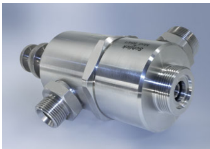
SCHLICK two-substance nozzle with liquid-regulating needle

Units with a liquid-regulating needle are also an option in cases of major flow rate fluctuations.