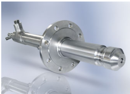
SCHLICK two-substance nozzle with external mixing and cooling jacket around the liquid

In external-mix systems, the liquid and the atomisation medium – mostly steam – are mixed together intensively shortly after leaving the front side. The outlet cone of the two-substance nozzle is positioned at approximately 30 to 40°.